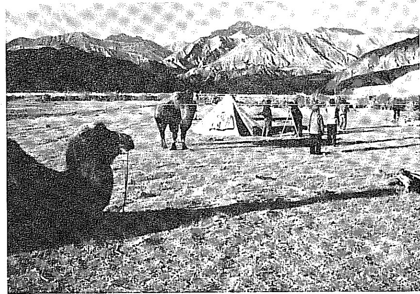
Fig. 2. The Tulai Nanshan in northern Qinghai is rugged and barren. We are camped by a willow-bordered creek in a valley of the Shule Nanshan. 10 October; 3200 m.

shrubs ( Kaladium , Salsola ) and a sparse cover of grasses and sedges along seepages (Fig. 3). However, the eastern Kunlun and the Anyemaqen Shan may have good pasture, and north and west-facing slopes may be covered with dense shrub ( Salix , Potentilla ) and patches of Juniperus forest that extend upward to 4400 m.