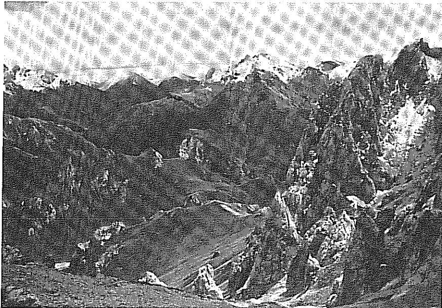
Fig. 4. Typical snow leopard habitat in the northern Zadoi area of southeastern Qinghai consists of limestone massifs. 28 August; 5000 m.