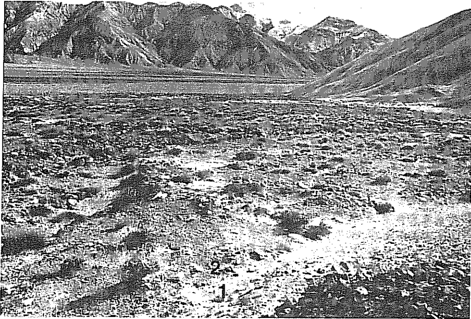
Fig. 3. Broad valleys break the eastern Kunlun Shan. Snow leopards often travel along the base of the hills and leave scrapes (just left of 1) and droppings (just left of 2) at the tip of spurs projecting into the valley. 3 December; 3800 m.