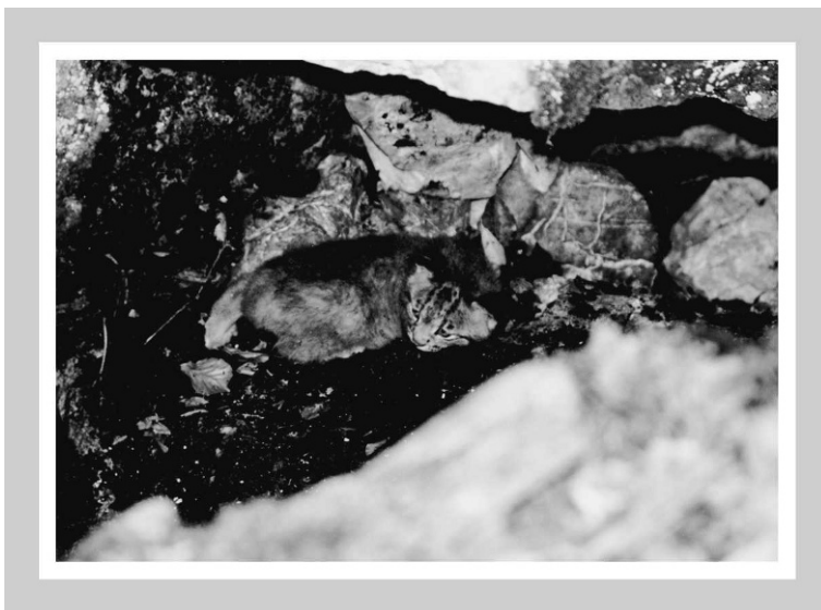
Figure 2. Natal den in a rock cleft (showing a kitten of female F34 in 2000). This is a rather typical situation since 65% of the dens were made of rock.

To avoid pseudo-replication, two dens, which were used by two females in two consecutive years, were considered only once for the analyses of microstructure and parameters describing the immediate surroundings. Two more sites were considered only once for the analyses of the topographic and strategic situation, because the females had used immediately neighbouring dens in consecutive years. Furthermore, for some den sites, we knew the location (because the female was repeatedly located at this place), but not the actual site (because the female had moved the litter before we could visit it). This leaves us with a basic sample size (see Table 1) of 42 for the microstructure and 66 for the macrostructure analyses. To test whether females had chosen consecutive dens according to individual preferences for specific den sites or habitat structures, we compared the different dens of the single females among themselves before running the subsequent analyses. We did not detect any particular preferences, except for the above-mentioned four pairs of identical dens/sites, which were exclud-